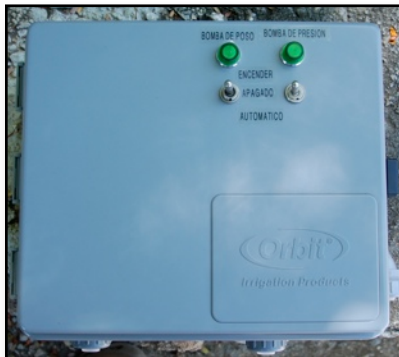
Automatic Pump Controller

We are preparing for the final construction phases of the water purification facility at Batey#3. The exterior building construction is complete and the finish work is moving ahead. By the end of September the ceramic tile work will be complete. We are preparing for 2 trips in the next 3 months. The first to install the electrical systems (including emergency battery backup) and the control systems for the water well pump. It will automatically keep the water storage tanks full while the electricity is on. Two water tanks supply all the water needed. One for both the school and church, another 1100 gallon tank, on the roof for the water purification facility. The electronic control system will send the water to the correct place to keep the