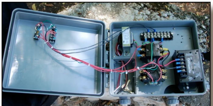
Automatic Pump Controller

tanks full. This equipment is easy to operate and easily by-passed if need be. The company from Santo Domingo is going to provide technical support and service for all our equipment. As we prepare for a visit to the cane fields I always am reminded of how