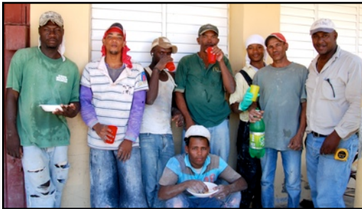
Our construction team we provide work for men in the area

especially for infants and children. Our work is just beginning, pure water is a means to the end, a means to show our love and lift the heads of those we serve. Pray for a new appreciation for life and a desire for spiritual growth among those who have so little. We thank God for allowing us to make a