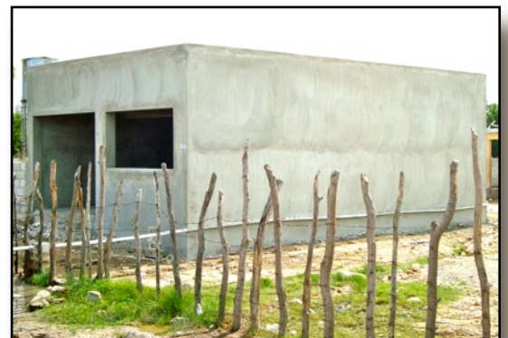
Source of Hope Pure Water Facility

The new pump house provides a secure place for the well and the control valves necessary. The well has a continuous flow of water with no pump needed. This “artesian” well is piped to the front of the building for public access and will remain so. We plan to add a concrete slab with a metal grate which will provide a place to wash clothes and children too. It is serving about 150-200 people daily with reasonably clean water. We define reasonable clean water (RCW) as untreated but from a deep well with minimal contamination. Not for drinking but good for all other uses. This is their only source of RCW. Most people have no idea of the levels of bacteria in the irrigation canal water.