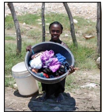
The "RCW" is great for doing laundry

TAKING TIME TO PRAY AND REFLECT ON THE NEEDS OF THE PEOPLE ARE CRITICAL. WE ARE TO BE MINDFUL OF THE NEEDS AND NOT OF THE WANTS. OFTEN THEY, JUST LIKE US, GET THE NEEDS AND WANTS MIXED. We strive to be a partner in change that lasts.